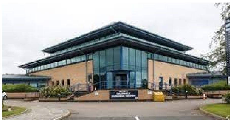
Lillyhall Business Centre, Workington